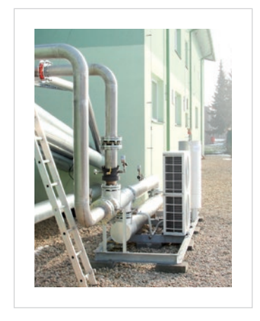
Biogas plant Vysoké Mýto - GTS 400