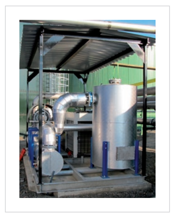
Biogas plant Pustejov - GTS 1200